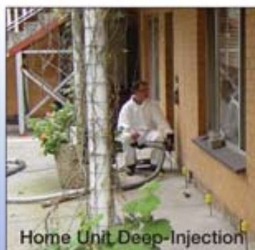
Home Unit Deep-Injection