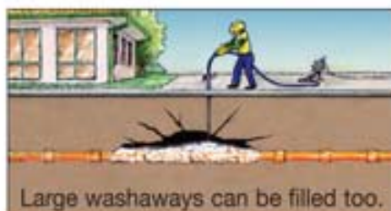
Large washaways can be filled too.

No excavation. Structural resin injection. No water and no mess.