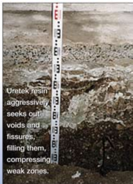
Uretek resin aggressively seeks out voids and fissures, filling them, compressing weak zones.