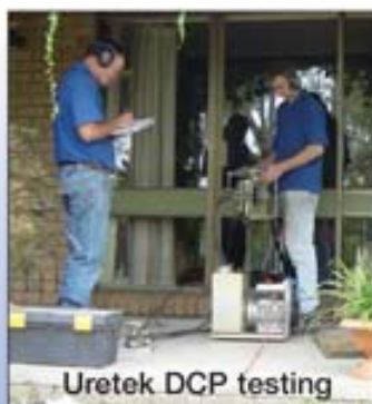
Uretek DCP testing

Uretek Deep-Injection is often used in conjunction with Uretek Slab-Lifting, or may be carried out where no lift is required.